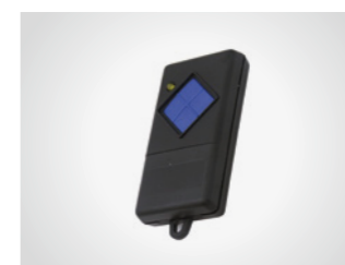
Hand transmitter Multibit

1-channel hand transmitter, 433 MHz, with Multibit code