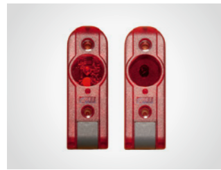
Integrated light barrier LS 2-I

2-wire, operating range 8 m, for inside areas