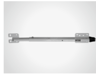
Fitting for sectional doors

For sectional doors with a slat height of 360 - 565 mm