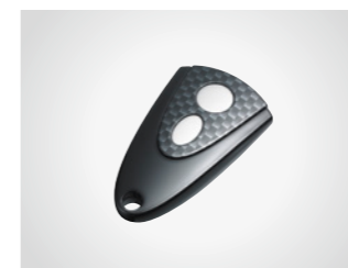
Hand transmitter Design

2-channel hand transmitter in carbon optics, 433 MHz, with KeeLoq rolling code