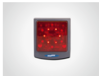
Warning light LED red

Flashing or steady light adjustable, 24 V AC/DC