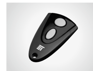
Hand transmitter MAX 43-2

2-channel hand transmitter, 433 MHz, with KeeLoq rolling code