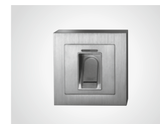
Finger print Biokey