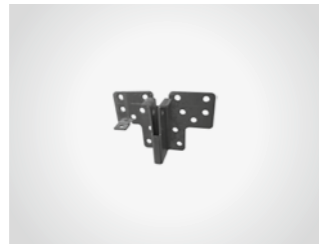
Special door fitting

Special flat type for up-and-over and sectional doors