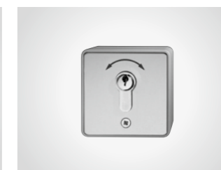
Key switch KT 8 AP