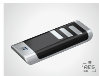
Hand transmitter BLACK Remote

3-channel hand transmitter, 433 MHz, with KeeLoq rolling code