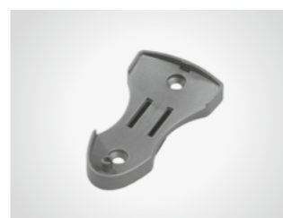
Wall mount for hand transmitters

With sun visor clip for MAX 43-2, MAX 43-4 (1) and MIX 43-2 (2)