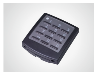
Push button DigiCode Premium

Metal keyboard, 433 MHz, with KeeLoq rolling code