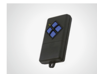
Hand transmitter Multibit

4-channel hand transmitter, 433 MHz, with Multibit code