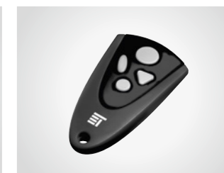
Hand transmitter MAX 43-4

4-channel hand transmitter, 433 MHz, with KeeLoq rolling code