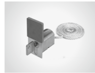
Emergency release with profile half cylinder

For double-leafed doors, sliding overhead and sectional garage doors