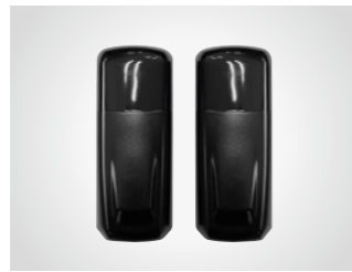
Light barrier LS 5F