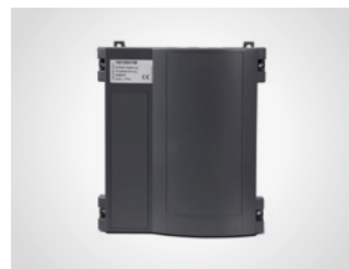
Traffic light control A 800 III

With 10 m connecting cable, without radio receiver