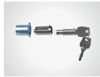
Emergency release with round cylinder

For double-leafed doors, sliding overhead and sectional garage doors